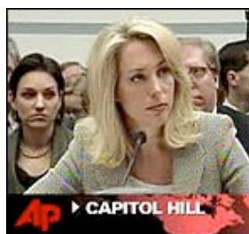
Video: Valerie Plame talks to Congress